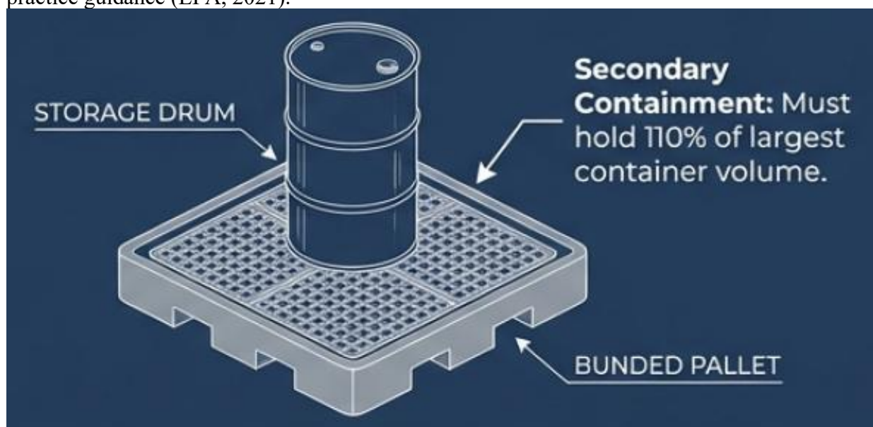
Figure 1 Schematic of a secondary containment system for hazardous liquid storage. Image generated by DALL-E 3, based on the authors' description (March 2026).

To minimise the environmental risks associated with hazardous liquids, the marina should implement a comprehensive system of operational controls, spill-prevention measures, emergency-response procedures, and performance monitoring. All hazardous liquids must be stored in clearly labelled, sealed containers that are compatible with the substances they contain, and must be placed within secondary containment systems, such as bunds or trays, capable of holding at least 110% of the largest container volume, in accordance with environmental best-practice guidance (EPA, 2021).